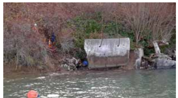
Swinomish Tribe (2)

The Swinomish Tribe is working to restore habitat for salmon's key food source.