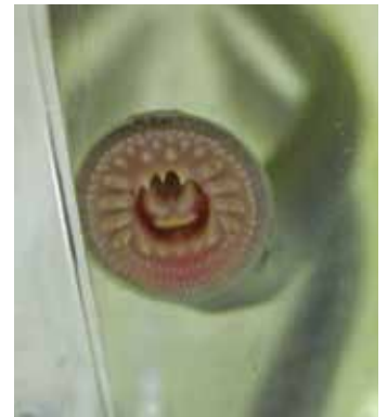
Lower Elwha Klallam Tribe (2)

After adult lamprey spawn and die, they provide nutrients to the system, much like spawned-out salmon. – T. Royal