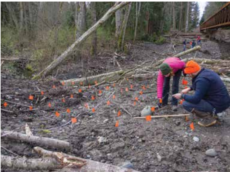
T. Royal (2)